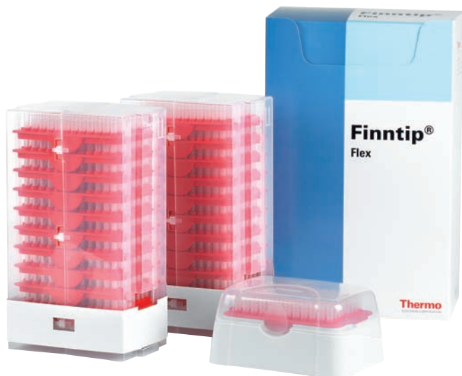
Finntip Flex 300 Refill Starter Kit

* Finntip Filters are certified to be free of DNA, DNase and RNase