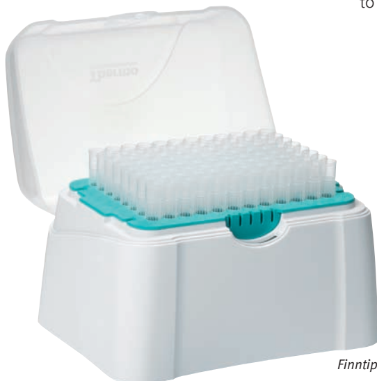
Finntip Flex 1200

Finntip Filters are ideal for PCR and other amplification methods, or for any work where aerosol contamination might occur. Finntip Filters effectively eliminate carry-over contamination, ensuring the success of the application. Finntip Filters 0.2 - 1000 µl are certified to be free of DNA, DNase and RNase.