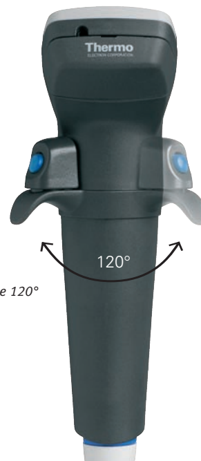
The finger rest is adjustable 120°

To ensure that it is always powered and ready to use, Finnpiquette Novus has a new lightweight, long life battery. Depending on the settings, the battery allows approximately 4000 pipetting operations and can be fully recharged in only 1 hour.