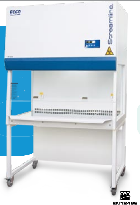
Streamline Class II Biological Safety Cabinet Model SC2-4A...