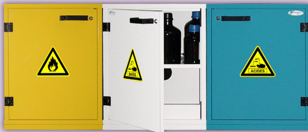
Range 6 - Model ABS90