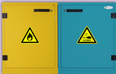
Range 6 - Model AS60