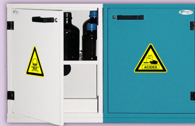
Range 6 - Model AB60