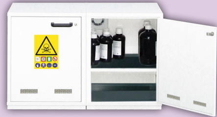
Range 14 - Model AB56