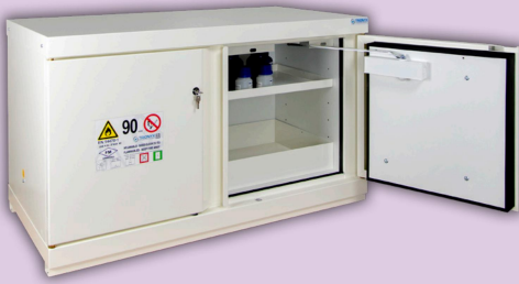
Range 790+M - Model 792+M11