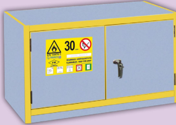
Range 3030M - Model 3032M11