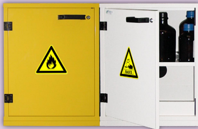
Range 6 - Model BS60