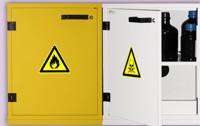
Range 6 - Model ST60