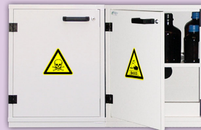
Range 6 - Model BT60